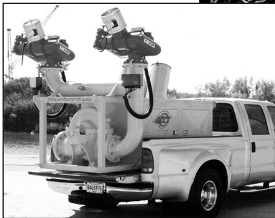
The MTT Turbine FP4400 is a compact unit that fits in the back of a pick-up truck and has the pumping capacity of four fire trucks.