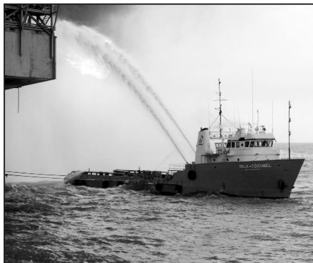
Marine Turbine Technologies' fire suppression pumps sit on this tugboat, circling an oil rig in Cozumel, Mexico, to keep the rig safe from the flame-out of natural gas.