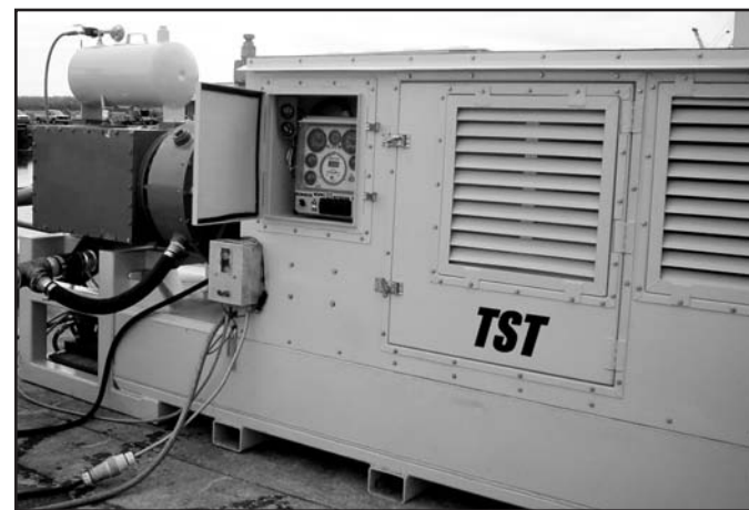
Turbine Stimulation Technologies has found the technology that major service companies have been seeking for more than 40 years in its turbine-driven frac pump.

All of the pumps currently being utilized in the well service industry are powered by diesel engines coupled by a transmission. The approximate weight of the engine, transmission and ancillary equipment associated with a similar needed package is approximately 21,000 pounds. The pump contributes an additional 14,000 pounds. That’s 35,000 pounds compared to the turbine package of approximately 18,000 pounds — a sizable increase in logistical efficiency and a siz-